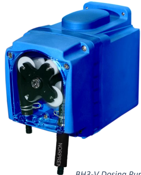
BH3-V Dosing Pump

The B series are a range of peristaltic pumps fixed and variable flow rates designed for discontinuous use. Both the B Series and BH Series are perfect for smaller dosing systems that require small amounts of chemical addition in short periods of time.